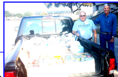
(ABOVE: Representatives from the St. Vincent Depaul Society are ready to take all the donations from Fall General back to the Food Bank. THANK YOU , to all those who brought in donations!

Start talking to your STUCO kids now about running! KIDS LOVE creating skits, themes, campaign slogans, and running for office!