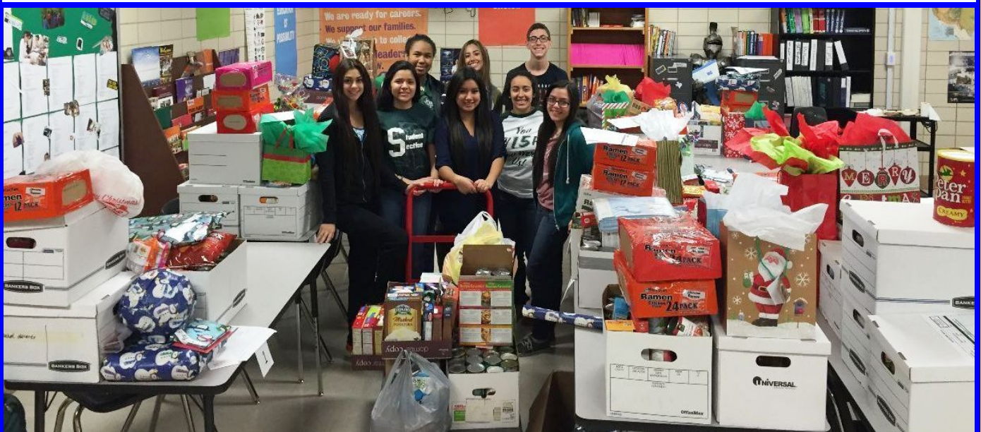
Above: Southwest H.S. STUCO Leaders with all the boxes of food and gifts ready to be delivered to needy families